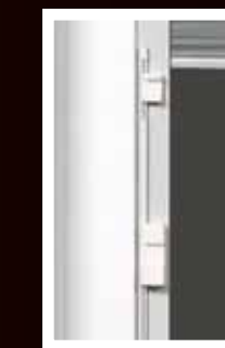
Raise / Lower