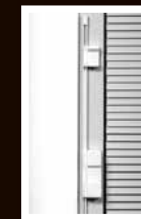
Tilt Open / Close

Control your privacy level with the touch of a finger. Internal blinds (blinds in between 2 panes of glass) give you a choice between a full clear view and total opacity. Raise, lower, open and close your blinds and never have to clean them.