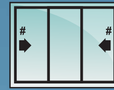
3 Panels # = Screen